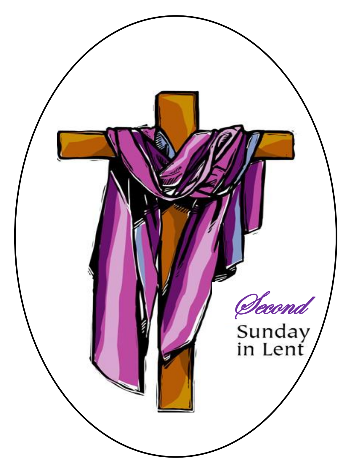
Lake Toxarvay United Methodist Church Sunday, February 28th, 2021